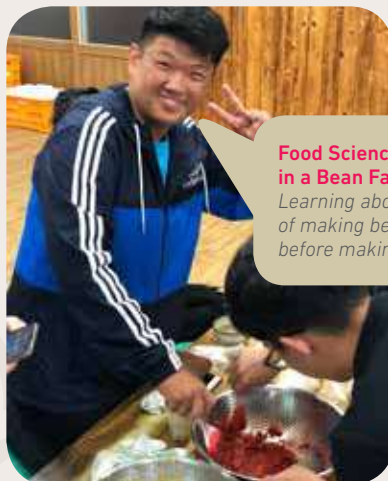
Food Science Lessons in a Bean Farm Learning about the science of making bean paste, before making our own!