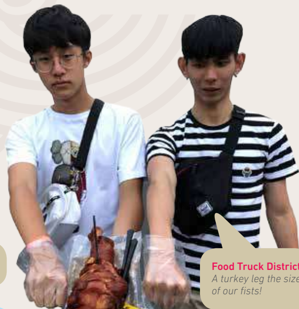
Food Truck District A turkey leg the size of our fists!