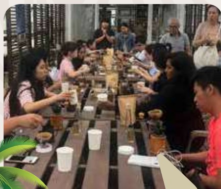
Coffee Farm Tour Learning to make coffee wine

Learning and tasting the different types of rice wine, known for their distinct quality using Jeju's pristine spring water.