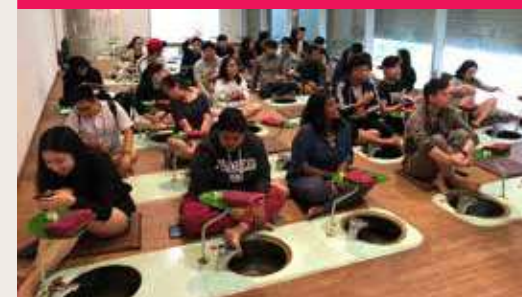
Jeju Massage using Green Tea Scrub with Volcanic Spring Water