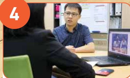
Sharing the inspiration for his menu with Marketing Communications