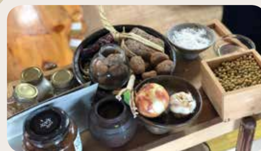
Ingredients to make Doenjang, or fermented soybean

Home to traditional fermented foods such as bean paste, soy sauce, hot pepper paste, using the eco-friendly agricultural products of Jeju.