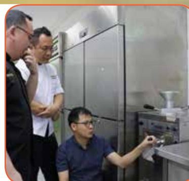
Ensuring the kitchen equipment is ready to go!