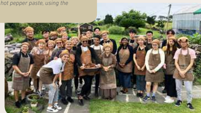
The numerous claypots outdoors are used to keep soybeans and other fermented products such as kimchi.