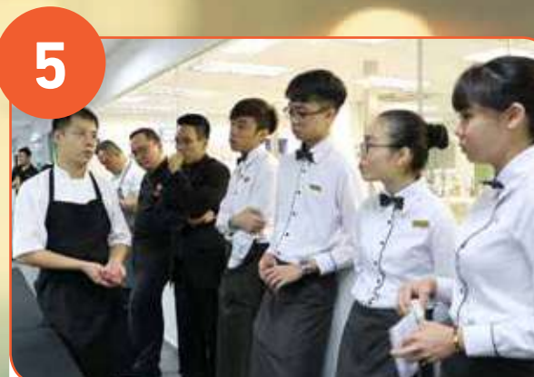
Briefing SHATEC's hospitality students for service