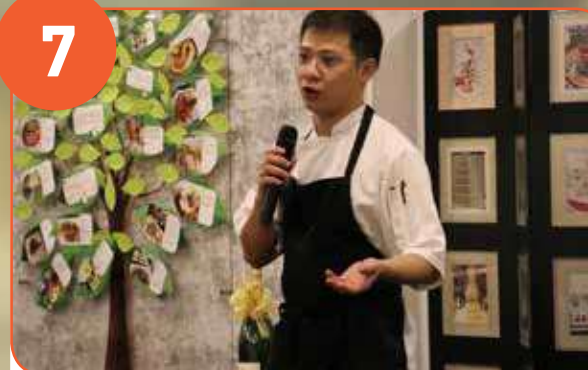
Explaining the highlights of the night's menu, such as the sweet and fatty lamb ribs sourced from Perth. A sustainable alternative, these lambs feed on food leftovers like carrot!