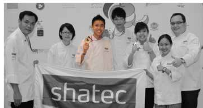
Congratulations to the team who brought back three medals at the Culinaire Malaysia 2011.

Fires burned and woks bubbled as 3 hosts and a host mentor from Shatec Institutes displayed their culinary skills at 2011's Culinaire Malaysia. Competing against 1,318 chefs and hosts from around Asia, our team bagged top honours at the gruelling four-day event held at the Kuala Lumpur Convention Centre from 20 – 23 September.