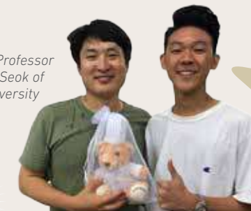
Campus Tour of Cheju Halla University The university offers culinary, pastry, hospitality four-year degree courses!