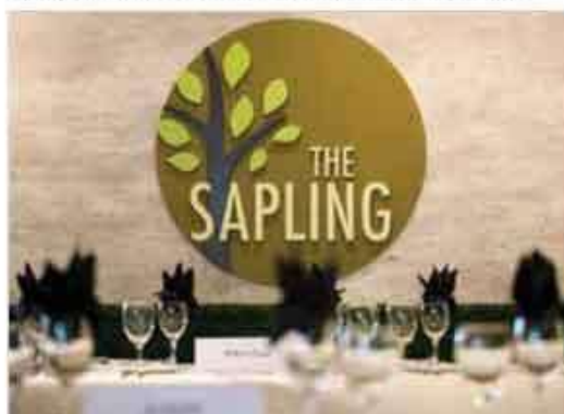
Charity Gourmet Night 2018 was held at The Sapling