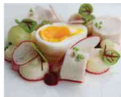
Chicken, Beets, Apples - Sous Vide Chicken Breast, Applewood Smoked Potato Mousse, Marinated Apples and Beets, Soft Boil Hen's Egg, Local Cress