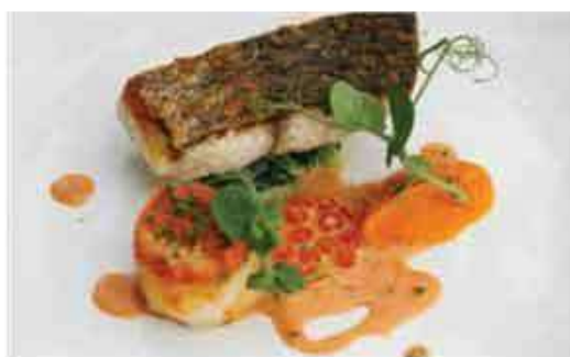
"Kurlbarra" Barramundi - Carrot Ginger Purée, Semi-dried Tomato, Potato Fondant, Garlic Chives and Kale Ragout. Trout Roe Pimiento Buerre Blanc